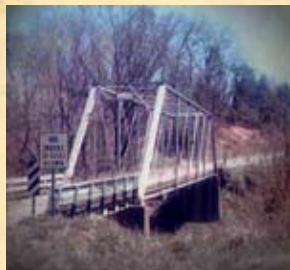
The Mariposa bridge photographed during the 1970s.